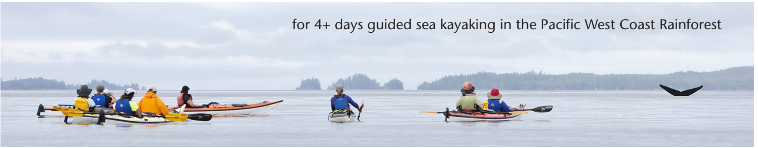
A Batstar group watching a Humpback Whale dive in Barkley Sound.

for 4+ days guided sea kayaking in the Pacific West Coast Rainforest